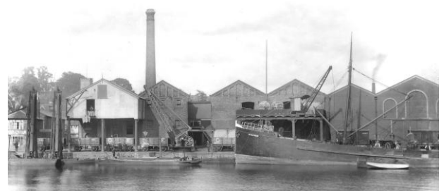
Ransomes Quay c.1890

Both UCS and the Borough Council have become interested in using our Archive in various novel electronic ways, the latest being in the form of QR tags allowing Waterfront visitors to bring up on their mobile phone screens Victorian images of the view in front of them as they walk along. For this, I have also written an illustrated historic 'Tour of the Dock' which will, I hope, shortly appear on our website and complement the 'Occasional Paper on Quays and Wharves'.