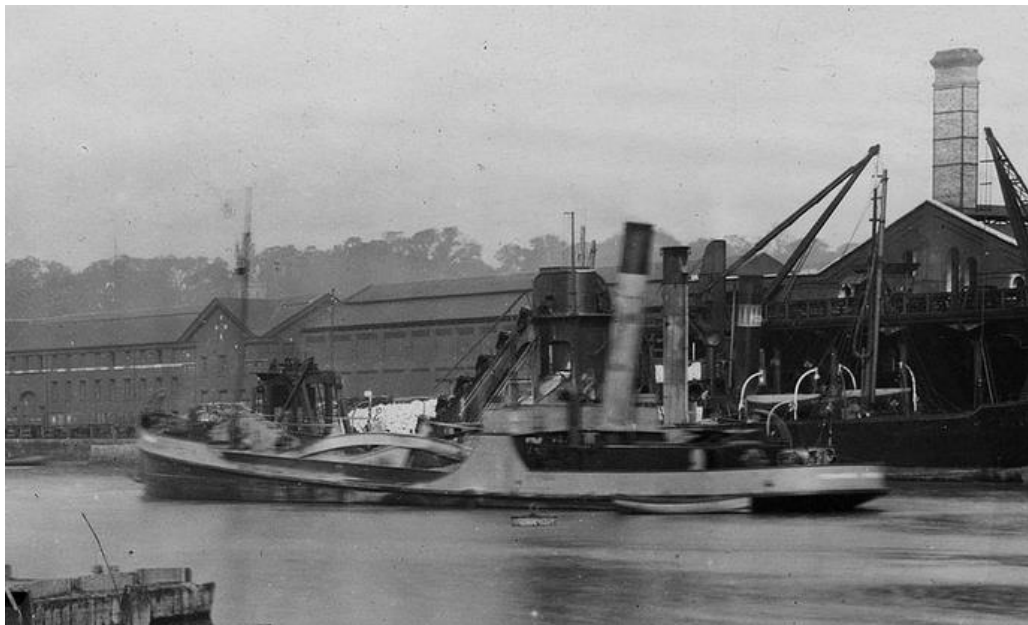
The dredger 'Downham'