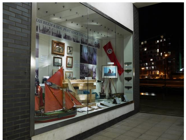
'Celebrating the Thames Barge'