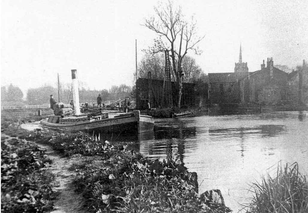
Barge 'Trent River' at Bramford

To access, either www.ipswichmaritimetrust.org.uk and press the 'IMT Image Archive button or www.flickr.com/photos/imt_image_archive/albums