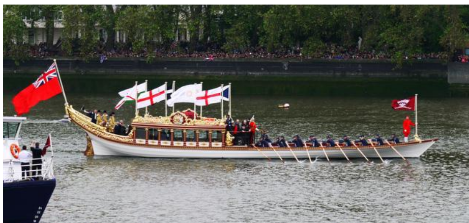
Gloriana (rowed by Olympic Oarsmen - and others!)