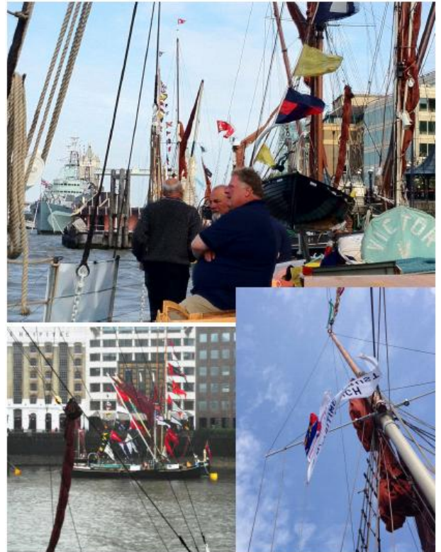
at the pageant