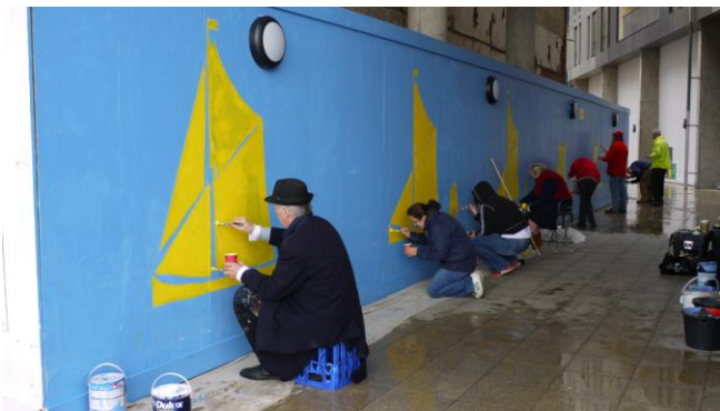
the (almost) finished paintings